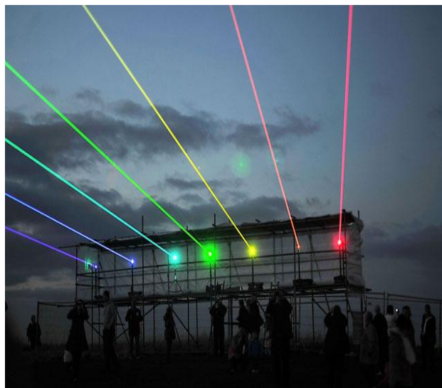
Global Rainbow in Whitley Bay, England