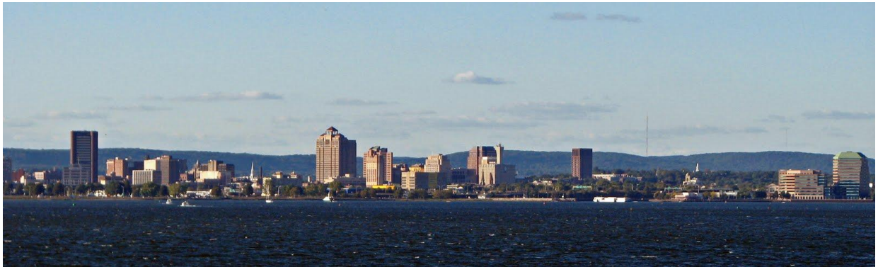
New Haven, present day

Discussion: What did this site look like 375 years ago? Make some predictions and visit: http://newhavenmuseum.org/ to view some of the oldest images of New Haven.