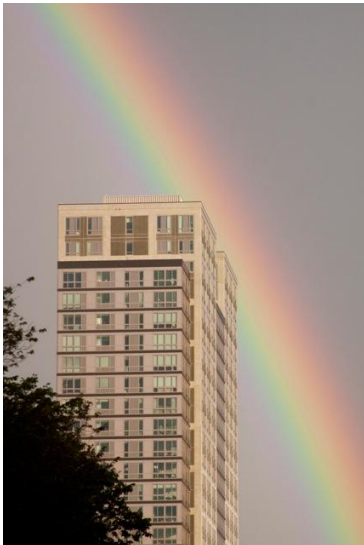
New Haven Rainbow

Attached you will find a series of suggested activities that: investigate natural rainbows by producing rainbow-like effects and laser technology, compare and contrast natural rainbows to the laser light installation and encourage you to develop theories about the impact such an artwork - in using technology to reproduce a natural phenomenon - has on our society.