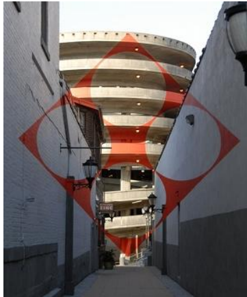
Square with four circles , Felice Varini, downtown New Haven, Temple Plaza, 2010.