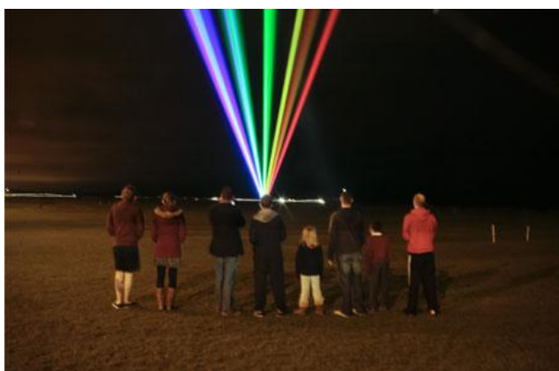
Global Rainbow, Preston, England, 2012

It is our hope that teachers will weave the artwork into existing curriculums. Site Projects will be offering guided nighttime tours of the exhibition. Here you will find several examples of how Site Projects envisions one might integrate the artwork into a variety of subjects as well as additional resources you may find helpful in creating your own projects.