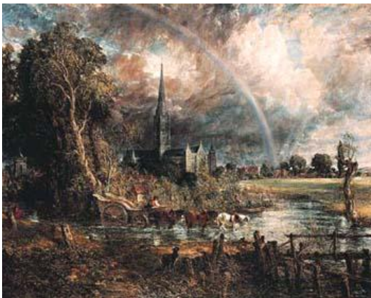
John Constable, 1831

You are also encouraged to participate in Sites.Camera.Action! , Film Shorts Festival, Fall 2013 .